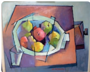
Painting by Shirley Straford